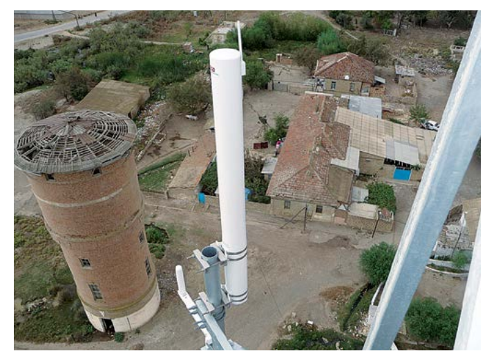
ERA's long range antenna (AL4W) deployed as part of a WAM system in Azerbaijan.